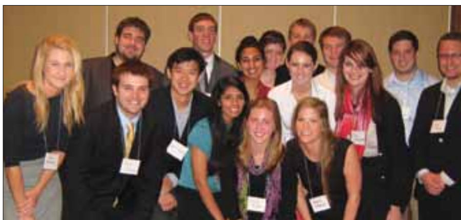
Participants in the department's 2012 Washington, D.C. Summer Internship Program